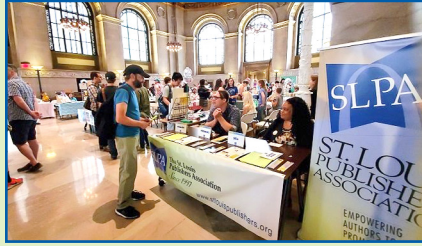
SLPA at the St. Louis Small Press Expo, August 17

SLPA members and volunteers attended the 6th annual St. Louis Small Press Expo (STLSPEX) held at the St. Louis Public Library Central downtown on Saturday, August 17. The entire day was a lively showcase featuring diverse literary creativity from zines, comics, and poetry, to indie publishers, artwork, and unique gifts. To learn more, visit http://www.stlspe.com .